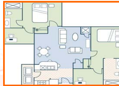
Den Style Two Bedroom 1024 sq. ft.

The Art Institutes International Minnesota offers students two different floor plans to choose from. Both floor plans are spacious, with ample storage space and range in size from 827-1024 square feet. Most students are assigned to our standard two bedroom/two bathroom apartments. The larger two bedroom den-style apartment is available on a limited basis.