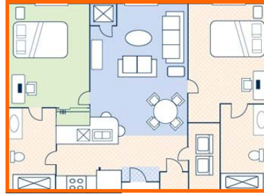
Standard Two Bedroom 827 sq. ft.