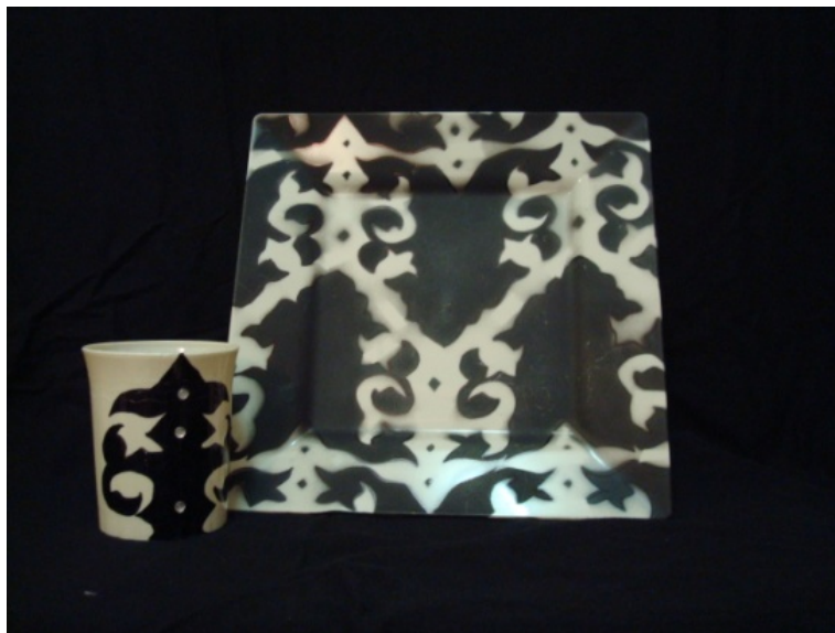
Chinaware Design for a Dining Room