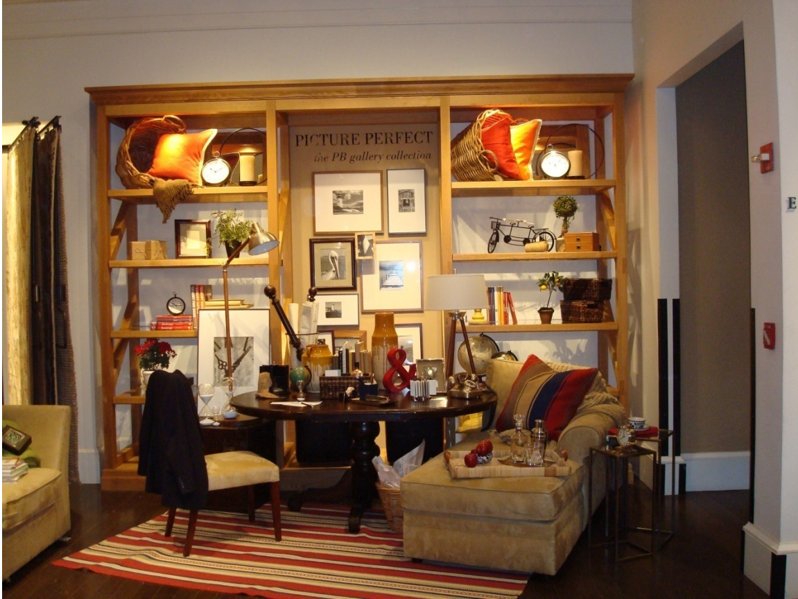
Award-winning design in the Pottery Barn/ASID school-wide competition. Each team was composed of students from participating schools, including SVA, FIT & NYSID.