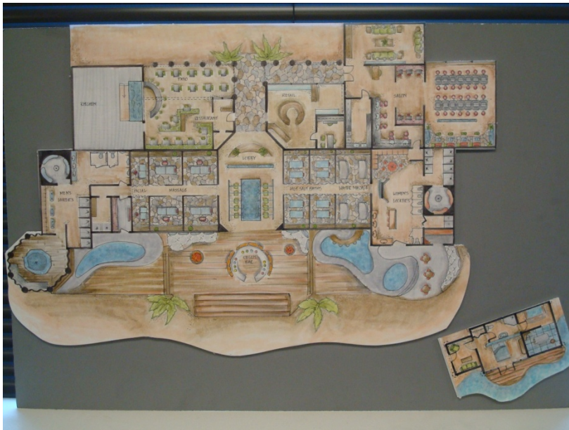
Floor Plan for a Resort & Spa

Some of Kasey Cosentino's designs are shown below.