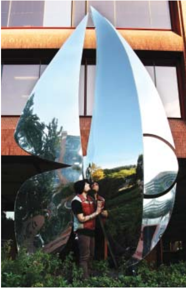
Above: Eileen Veight's photograph of Gift of the Winds by Joseph C. Bailey

Twelve photographs by six Photography students at The Art Institute of Philadelphia will be included in the exhibit alongside