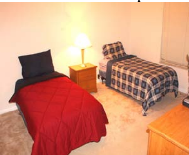
Dorm style living, two twin beds per bedroom