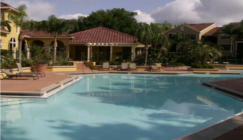
3 pools on property

Affordable Student Housing... Combining the Affordability of Dormitory Style Living with the Independence and Privacy of Apartment Living.