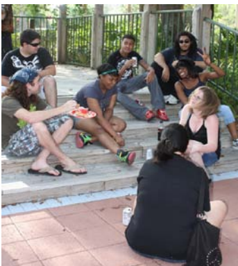
Latest student pizza party

Check out our Art Institute of Tampa Housing MySpace Website myspace.com/aistudenthousing